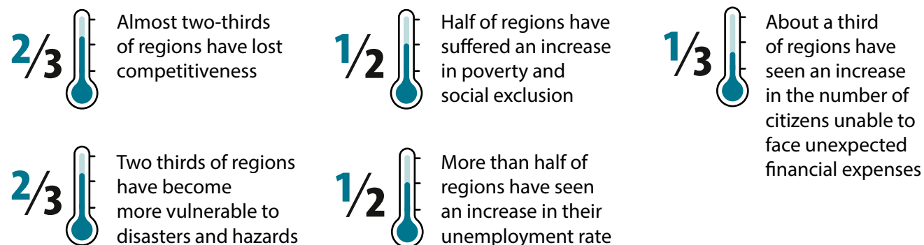
Figure 2 — Regional thermometer of socio-economic development: changes in recent years.

Even if 95% of all regions register an improvement in GDP per capita (2023 vs 2022) and have reduced their level of greenhouse gas emissions, the underlying socio-economic development remains much weaker. Indeed, when compared to the EU average: